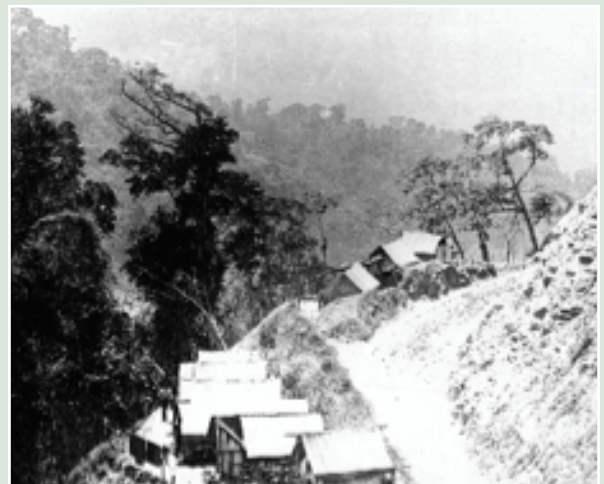
Workers camp c. 1890

Imagine the difficulty of digging these tunnels with just picks and shovels. To add to the hardships, the men had to supply their own tools if they wanted a job.